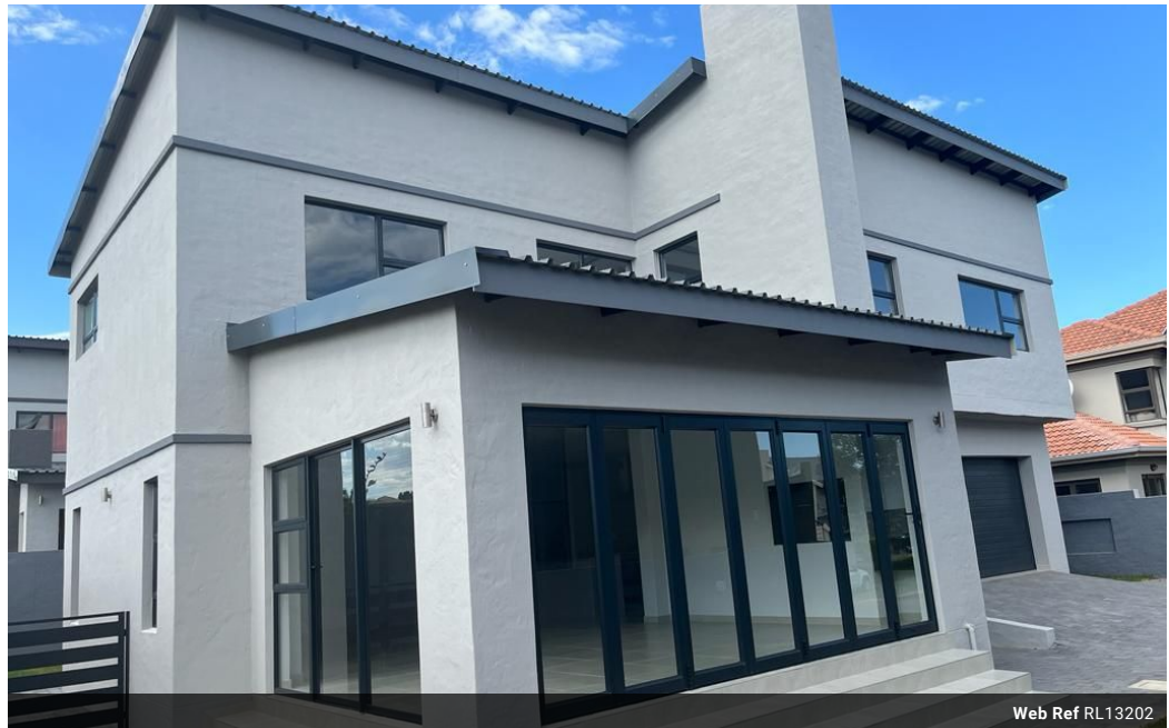
Web Ref RL13202

829 St Bernard Street Garsfontein Pretoria