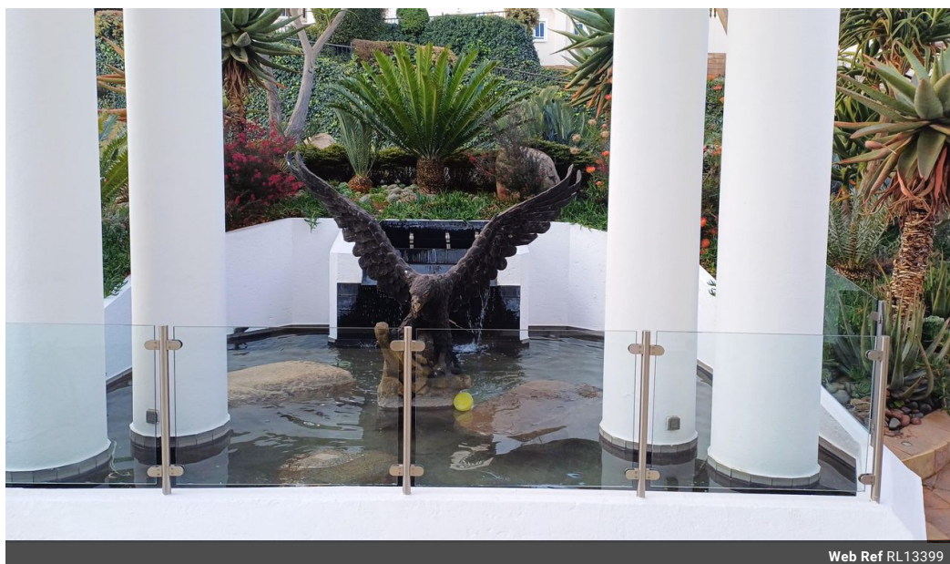
Web Ref RL13399

829 St Bernard Street Garsfontein Pretoria