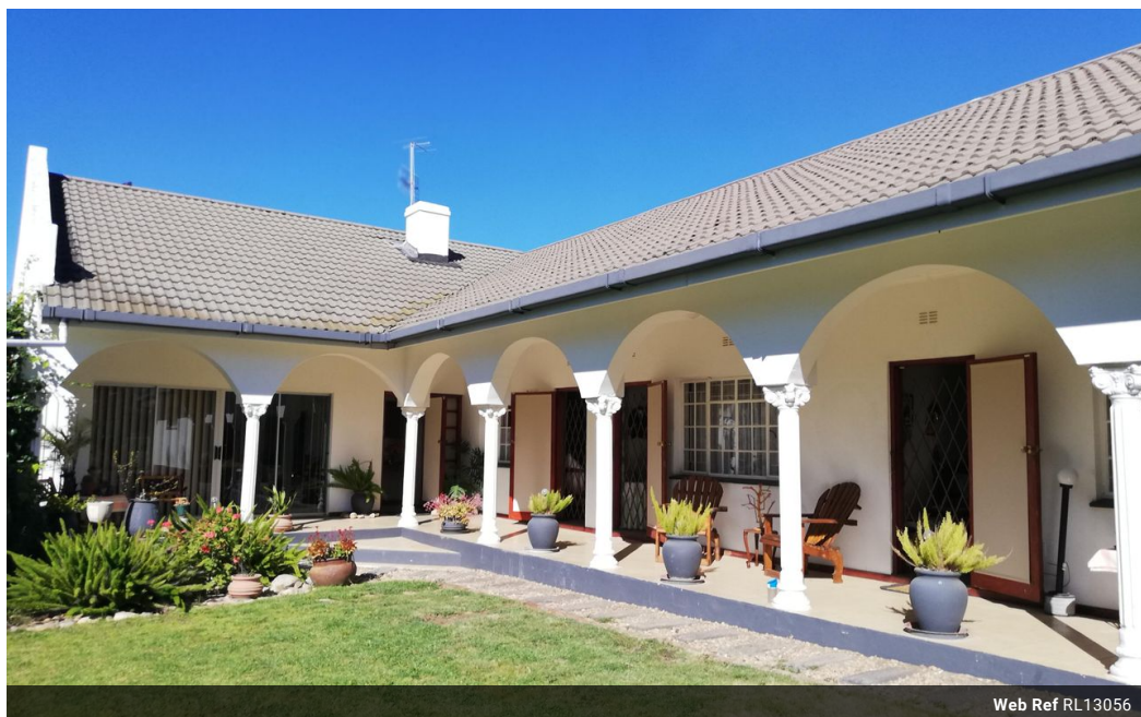
Web Ref RL13056

829 St Bernard Street Garsfontein Pretoria