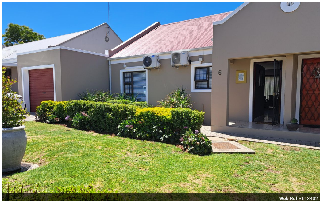
Web Ref RL13402

829 St Bernard Street Garsfontein Pretoria