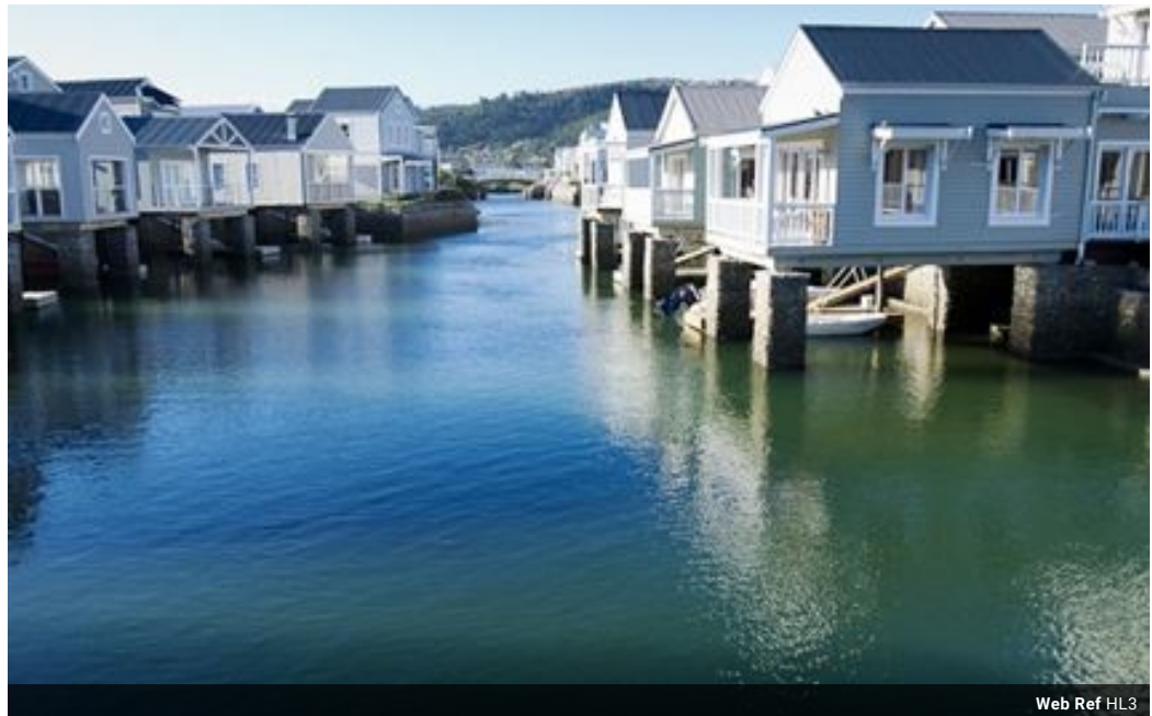
Web Ref HL3

829 St Bernard Street Garsfontein Pretoria