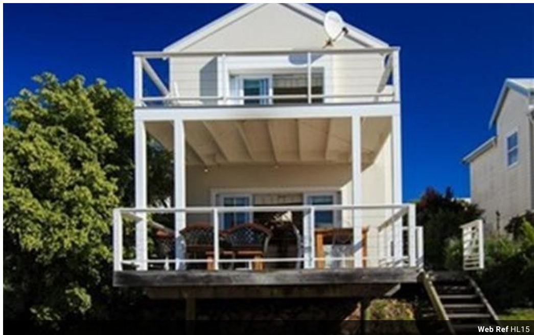
Web Ref HL15

829 St Bernard Street Garsfontein Pretoria