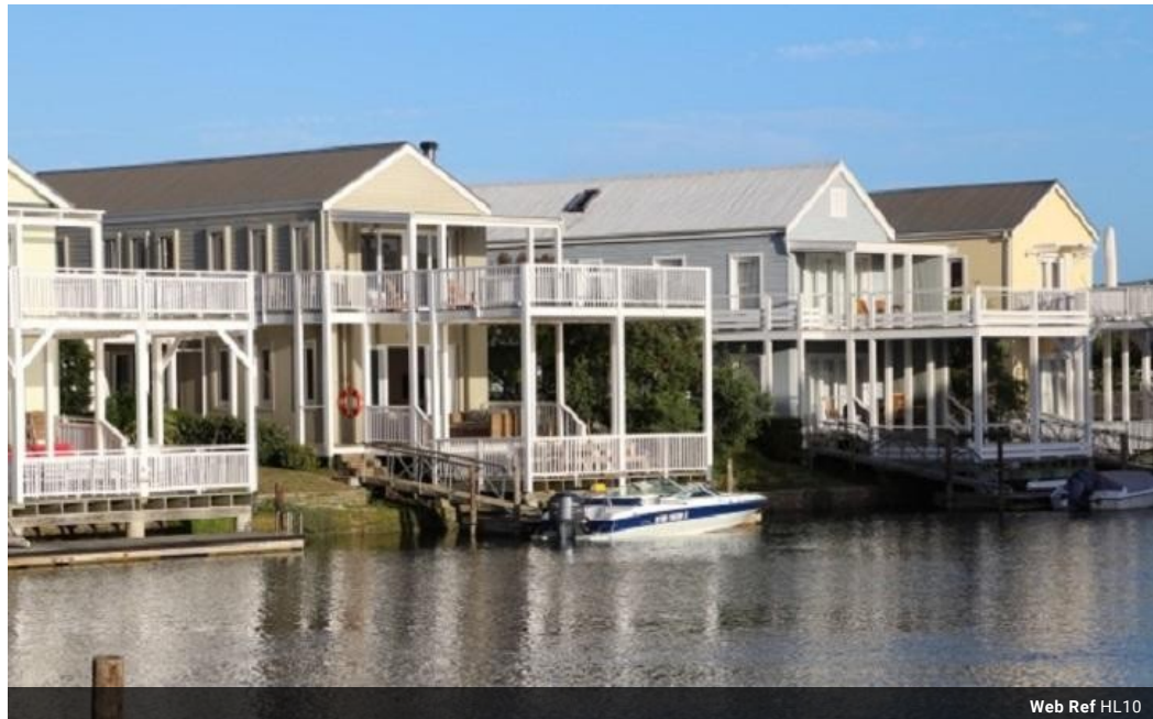
Web Ref HL10

829 St Bernard Street Garsfontein Pretoria